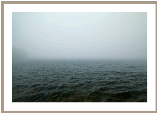
The Only Noise Came From Rain, 2017