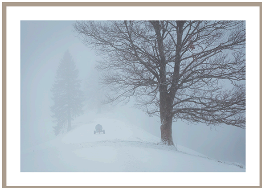
Forgotten Watertank, 2017