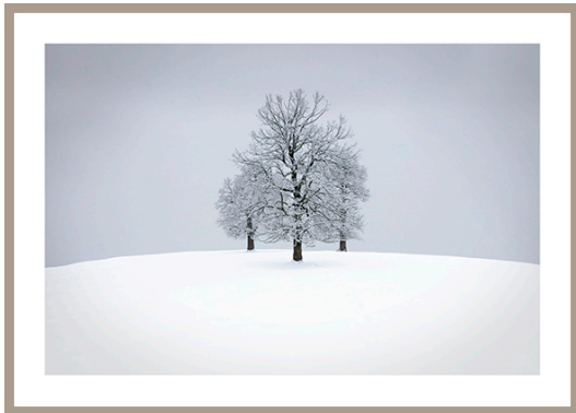
Winter Wonderland, 2016