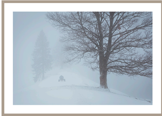
Forgotten Watertank, 2017